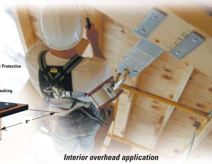
Interior overhead application

This equipment should only be used in conjunction with the manufacturer's instructions. Failure to follow instructions could result in serious injury or fatality.