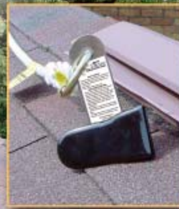
Exterior rooftop application