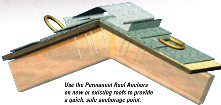
Use the Permanent Roof Anchors on new or existing roofs to provide a quick, safe anchorage point.